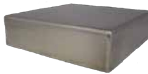
Wrapped Stainless Steel