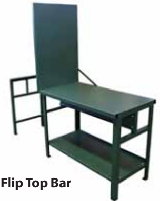
Steel Flip Top Bar