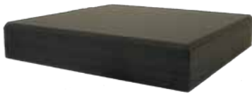
Phenolic Resin Lab Top

Other tops are available for Pollard's open leg workbenches. Please contact Pollard's office for more information.