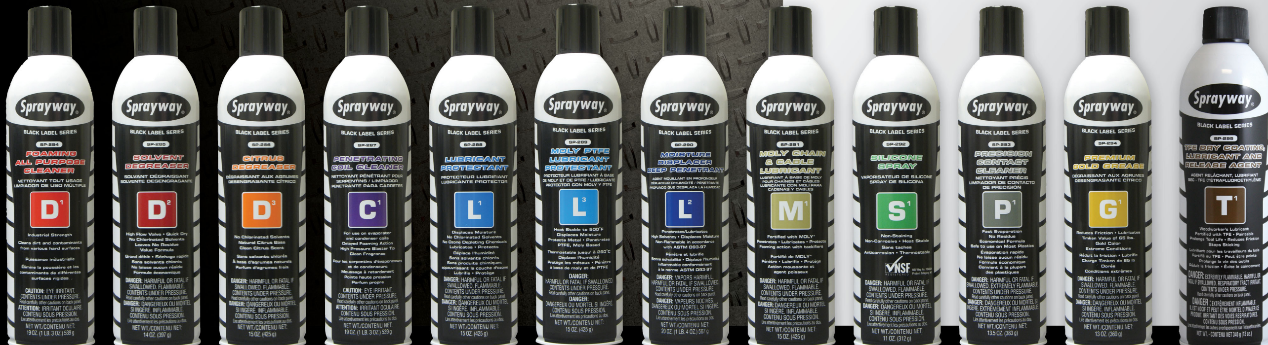
SP284 SP285 SP286 SP287 SP288 SP289 SP290 SP291 SP292 SP293 SP294 SP295

This non-oily, non-staining woodworker's lubricant remains dry during use. Extremely slick, T1 will not melt below 500°F, will not attract or hold dust or dirt and will not become gummy. Repels oil and water. Reduces friction. Inhibits resin build-up while it prolongs tool life.